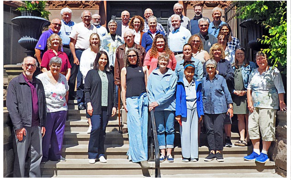
Attendees at the Learning Centre National Conference

A national conference for our Scottish Rite Charitable Foundation Learning Centres was held this past June in the Scottish Rite Club in Hamilton. A wide range of Learning Centre staff, tutors, volunteers and board members were in attendance from our nine Learning Centres across Canada. For some, it was a time to renew past acquaintances and friendships while for most it was an opportunity to meet for the first time.