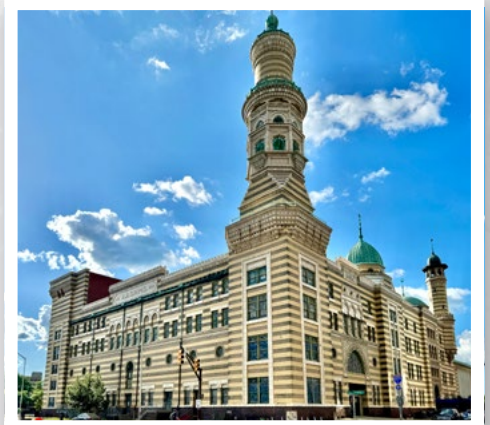
Murat Theatre now known as the Old National Centre

The highlight for many of the attendees came on Tuesday when the 33 rd Degree was conferred on a class of 138 candidates. The ceremony was