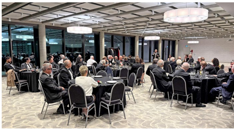
Attendees at the Reunion Banquet