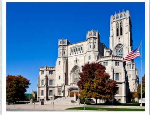
The Indianapolis Scottish Rite Cathedral