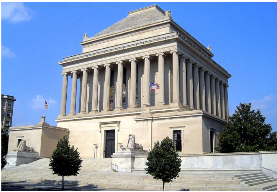
The House of the Temple, Washington D.C.